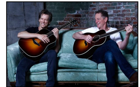
Bacon Brothers Band Aerie & Auxiliary Banquet Tuesday, August 11

To view multiple videos of Eagle events type: