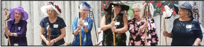
Prineville Eagles #2555 celebration the Kentucky Derby Eagle Style